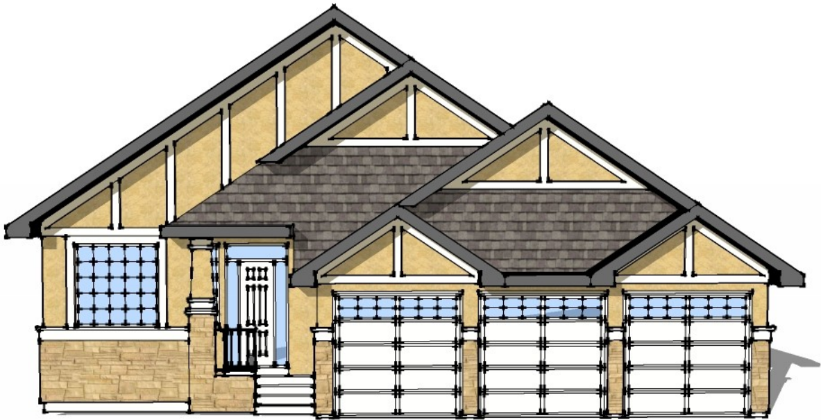
opt. 3rd garage bay